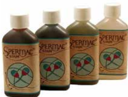
Spermac stain kit