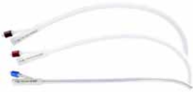
Embryo flushing catheter CH 28