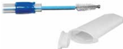
Cytology Brush equine