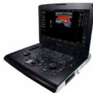
Ultrasound device Versana Active