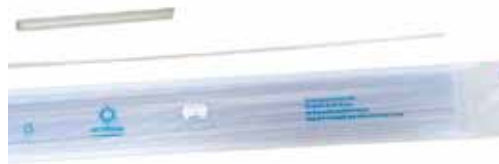
Equine insemination pipette, with Luer end, 60 cm