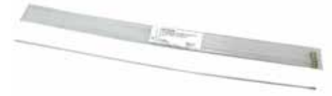
DIUI sheath for 0.25 ml straw