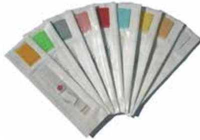
MiniStraw, 0.25 ml