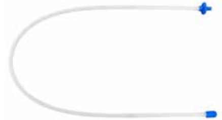
Equine Universal AI pipette, length: 57 cm, 1/bag, sterilized