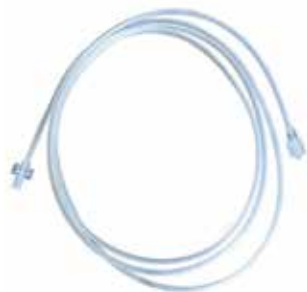
EquiPlus OPU recovery medium, with BSA