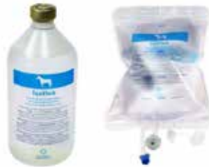
EquiFlush embryo recovery medium with BSA and antibiotics, 1 l, bag