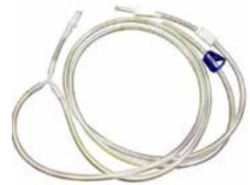
Y-junction tubing, large lumen, spike port