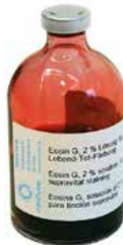
Eosin G stain, 2% solution for live/dead cells