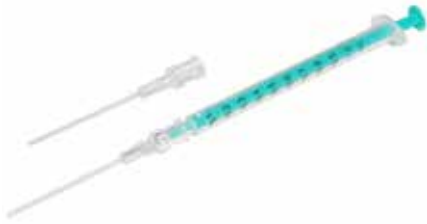
Steripette to manipulate embryos and oocytes