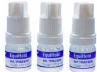
EquiHold, holding medium for equine embryos, 3 x 5 ml