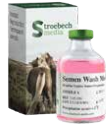
Equine Semen Wash Medium