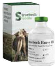
Stroebech Heavy Oil