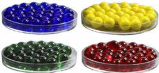
Sealing ball for Macrotubes, metal 1000/bottle