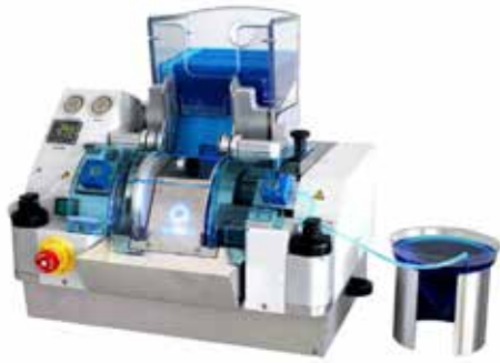
MPP Uno, automatic filling and sealing machine for semen straws