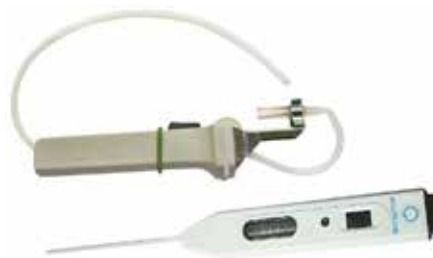
Micropipettor for embryo handling