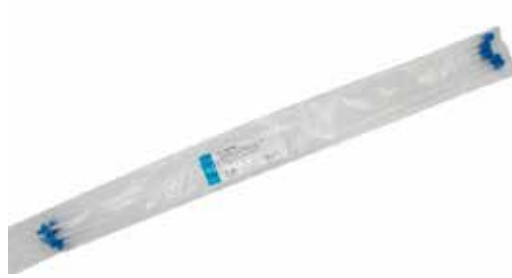
Equine Universal IUI pipette with inner catheter, 65 cm, 5/package