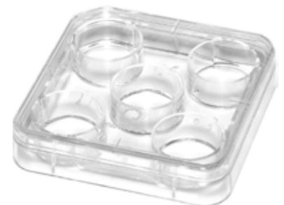
5-well dish with lid

Note: Variants of All equipments are available, Visit ( https://www.minitube.com/catalog/en/bovine/ ) for more details