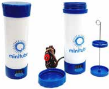
MiniThaw thawing unit