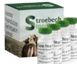
Equine Warming Kit