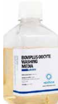
BoviPlus OPU washing medium