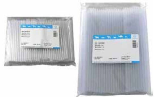
Macrotube, 2.5 ml, Length 140 mm 100/bag