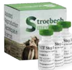
Equine Vitrification Kit