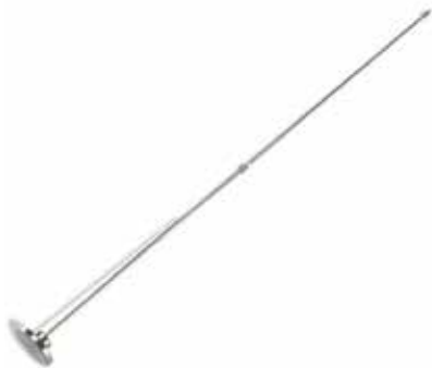
Flexible stylet used with Universal insemination pipette 57 cm and 0.5 ml straws