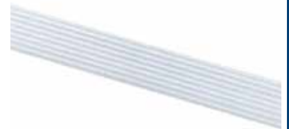
Disposable capillary tube, plastic