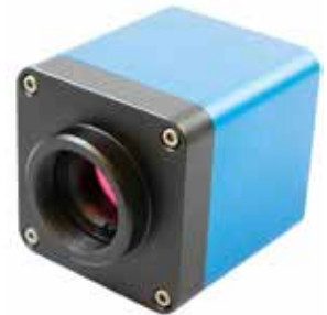
Digital color camera for microscopes