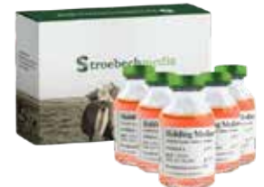
Equine Holding Medium