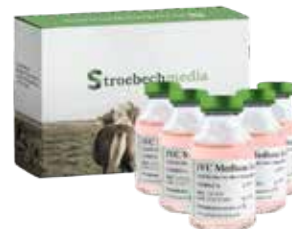
Equine IVC Medium 1 - Cleavage