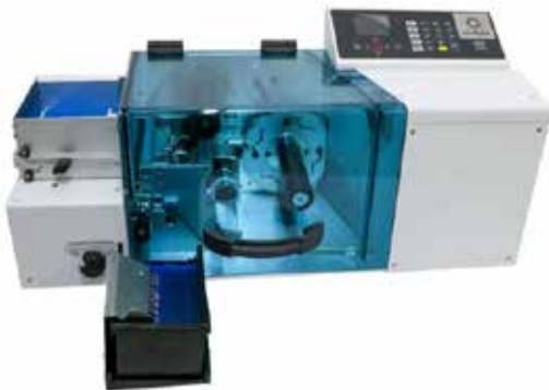
EasyCoder, automatic printer for 0.5 and 0.25 ml straws