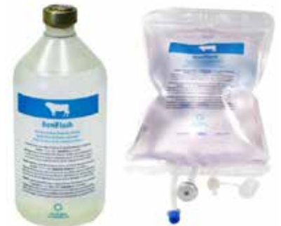
BoviFlush embryo recovery medium