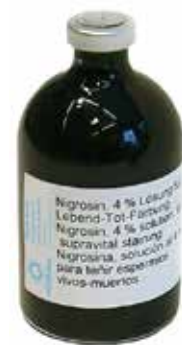
Nigrosin stain, 4% solution for live/dead cells