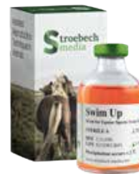
Equine Swim Up Medium