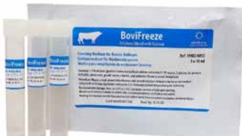
BoviFreeze, freezing medium for bovine embryos