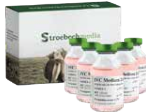
Equine IVC Medium 2 - Blastocyst