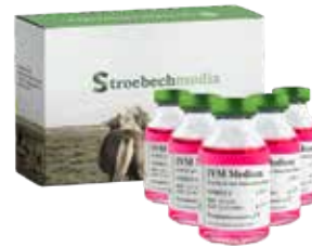
Equine IVM Medium