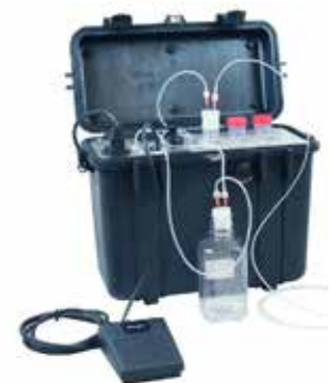
Aspiration pump for bovine OPU

Note: Variants of equipments full range of medias are available, visit ( https://www.minitube.com/catalog/en/bovine/ ) for more details