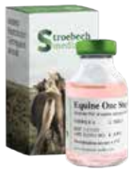
Equine One Step IVC Medium