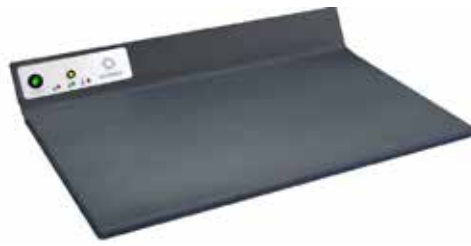
Laboratory heating plate