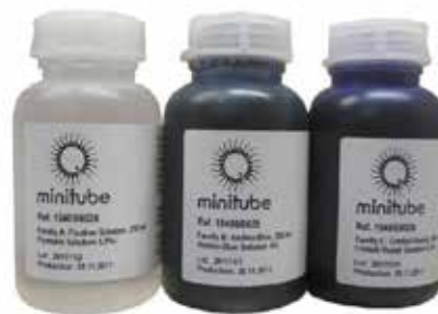
Farely stain for morphology evaluation