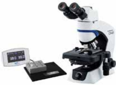
Phase contrast microscope Olympus CX43