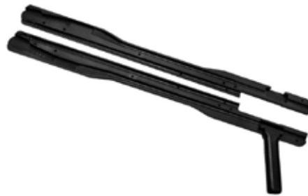
Ultrasound probe holder for equine OPU