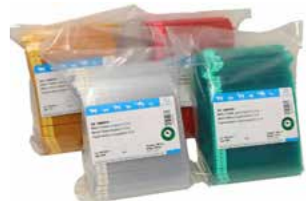
EcoStraw, 0.5 ml, transparent