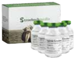
Sperm Gradient Upper & Lower