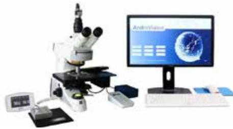
AndroVision CASA software with PC