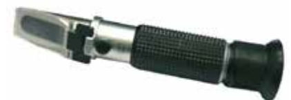
Refractometer for measurement of IgG levels in colostrum