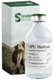
Equine OPU Medium