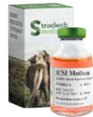
Equine ICSI Medium