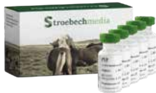
Equine PVP Medium