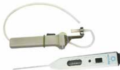
Micropipettor for embryo handling, model A