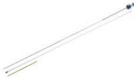
DIUI set for equine AI and ET