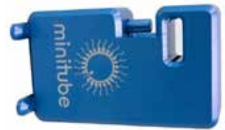
AndroScope, mobile semen analysis unit