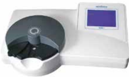
Photometer SDM 1, calibrated for equine