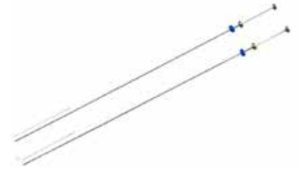
ET Cannula for embryo transfer