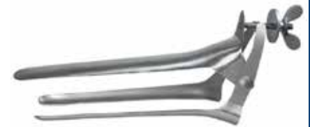
Polansky vaginal speculum for mares