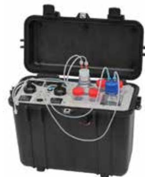
Aspiration and flushing pump for equine OPU