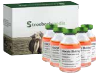
Oocyte Holding Medium